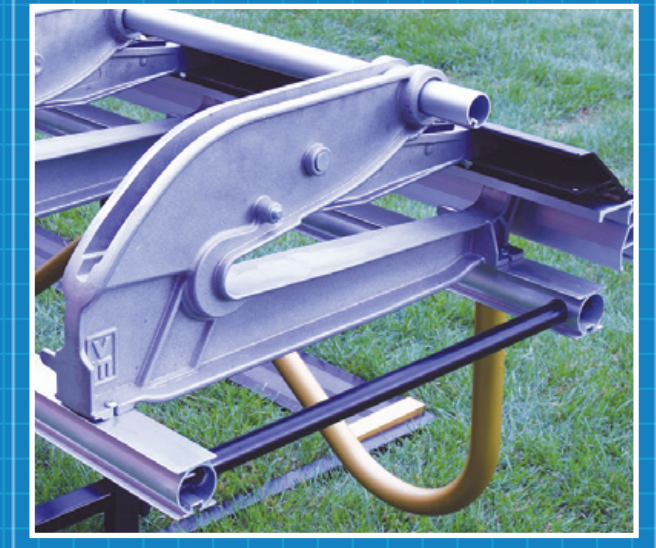
New base castings are the backbone of the brake. Still a full 20" throat depth, deepest in the industry.